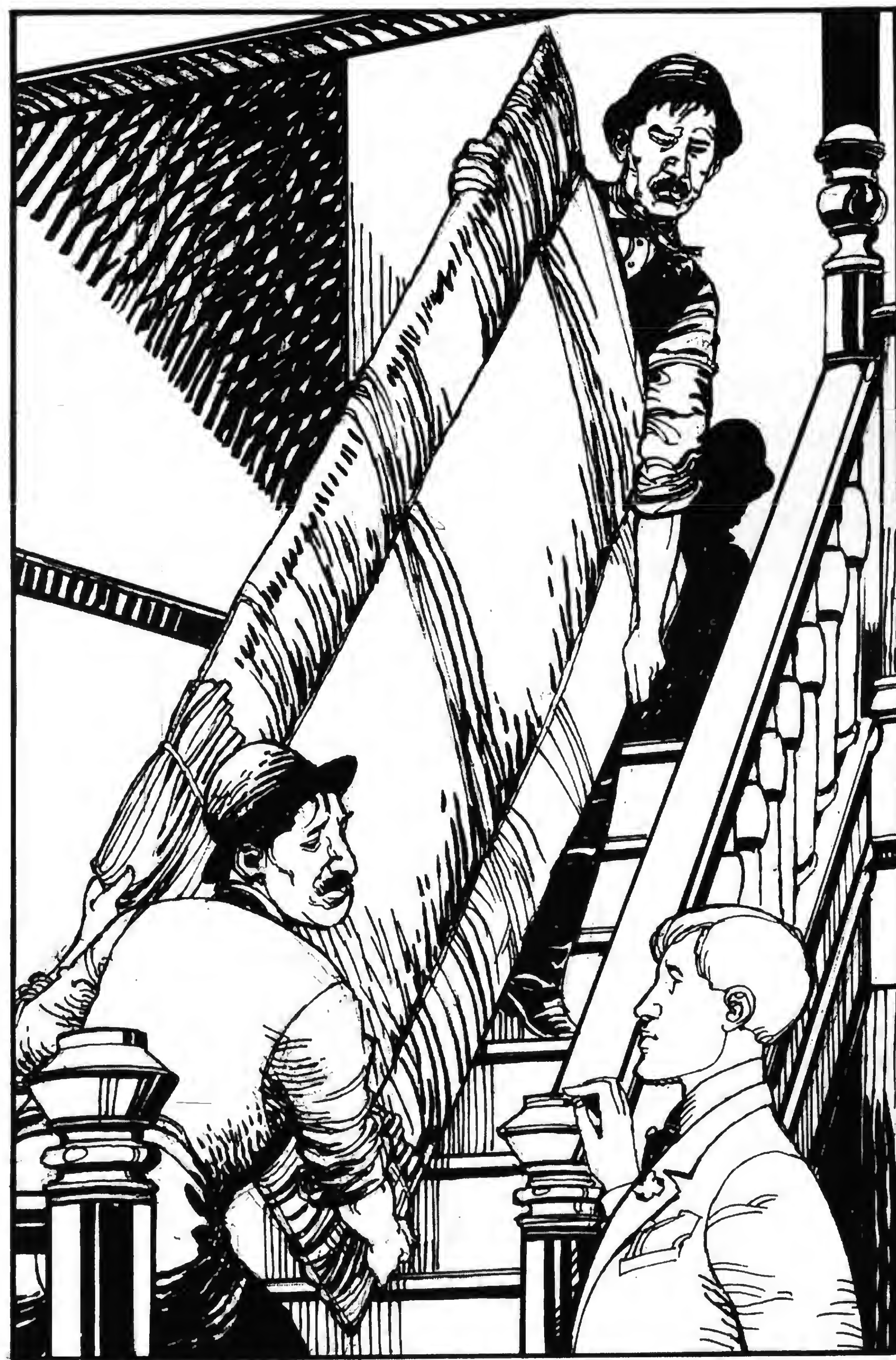
‘It’s very heavy, sir,’ said one of the men, as they climbed the stairs.

When the men had gone, Dorian locked the door, and put the key in his pocket. He felt safe now. No one would ever look at that horrible thing. Only he would ever see his shame.